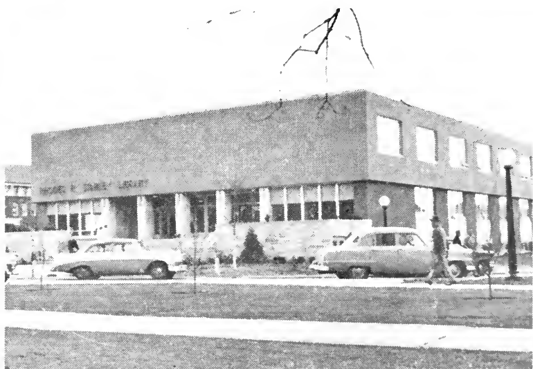
Rhodes R. Stabley Library

Plan to attend Alumni Day May 25, 1963, at "Your" College Reunions set for Classes 1888, 1893, 1898, 1903, 1908, 1913, 1918, 1923, 1928, 1933, 1938, 1943, 1953